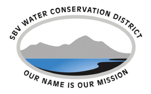
March 4, 2016